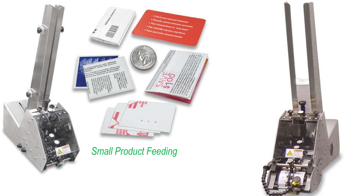
Small Product Feeding

From barcode reading to integrating a vision system for variable batch counting, we have your solution. We have developed solutions for automating products as diverse as multifolded pharmaceutical inserts to bound books.